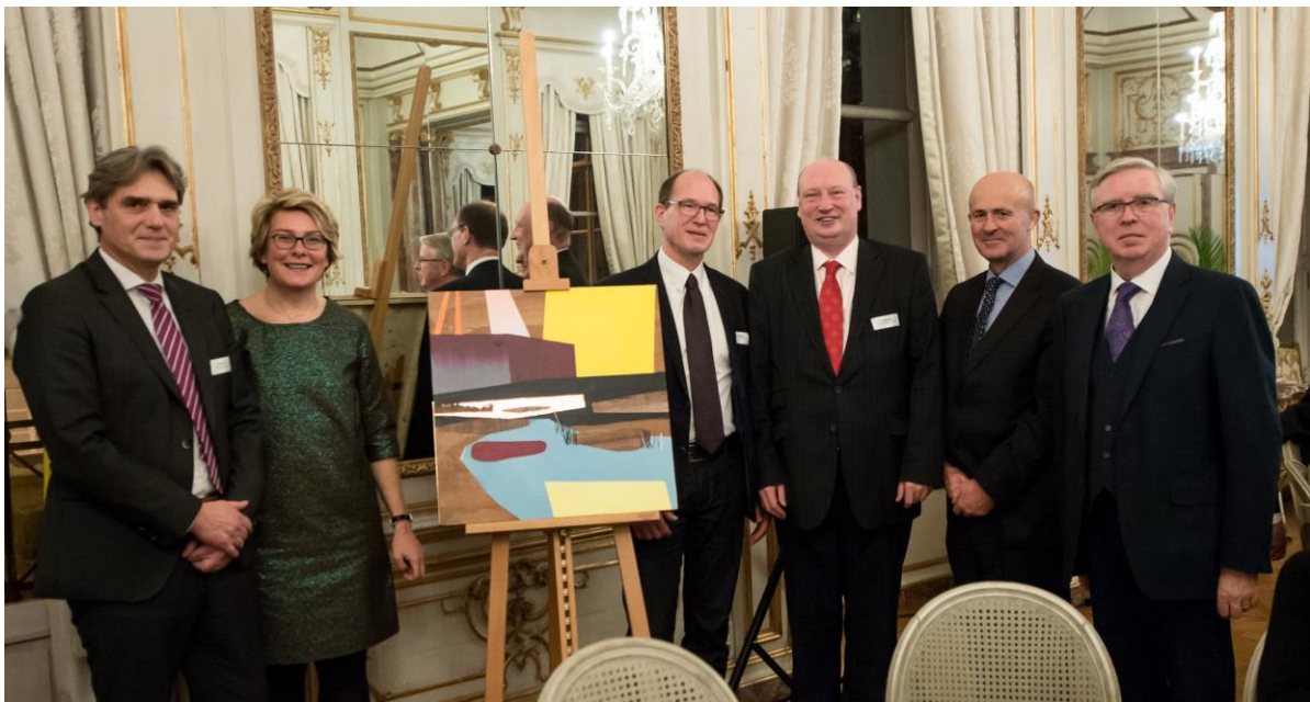
9 November 2016: BremenHaven wins ESPO Award Ceremony at the Egmont Palace, Brussels

The ninth ESPO Award will be officially handed out during a ceremony which will be held on Wednesday 8 November 2017 in Brussels.