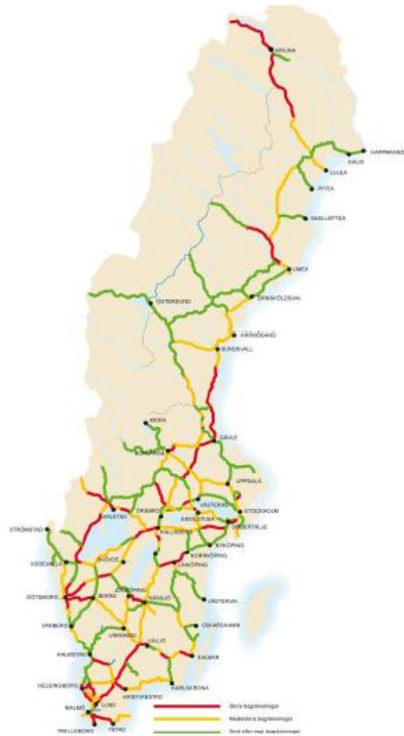
Figur 8.1: Kapacitet JA 2030 dygn

Källa: Trafikverkets Kapacitetsutredning