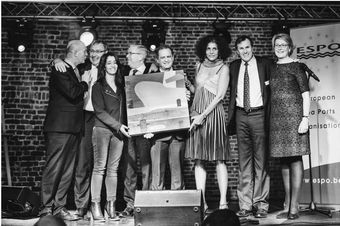
8 November 2017: Guadeloupe Ports Caraïbes wins ESPO Award Ceremony at La Tentation , Brussels

The tenth ESPO Award will be officially handed out during a ceremony which will be held on Wednesday 7 November 2018 in Brussels.