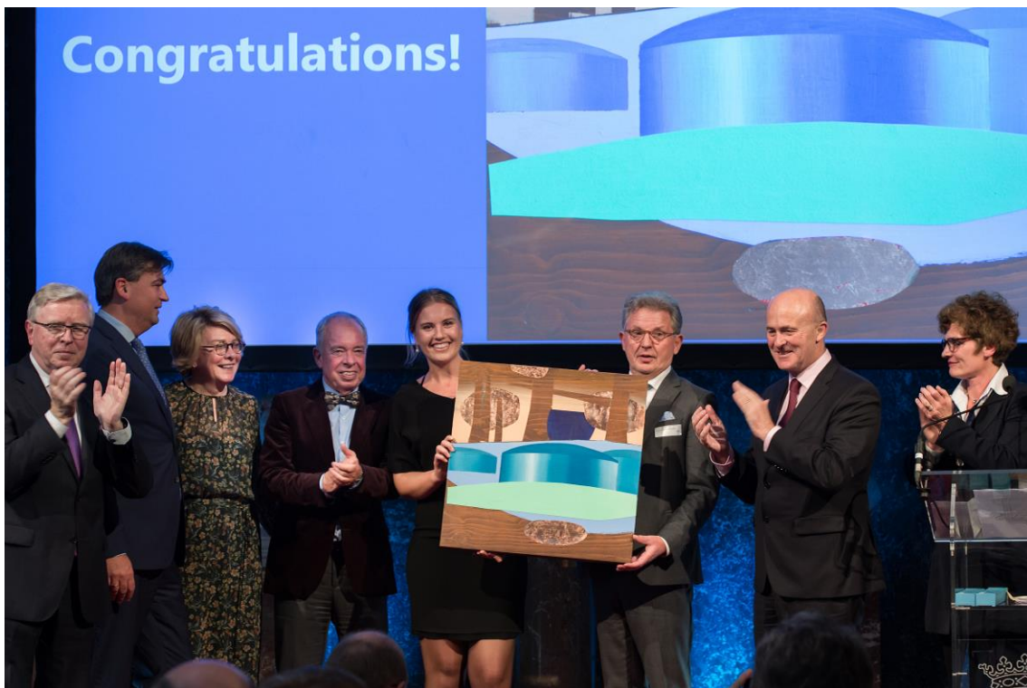
ESPO Award 2018: Port of Rotterdam wins ESPO Award Ceremony at Palais des Académies , Brussels

The tenth ESPO Award will be officially handed out during a ceremony which will be held in November 2019 in Brussels.