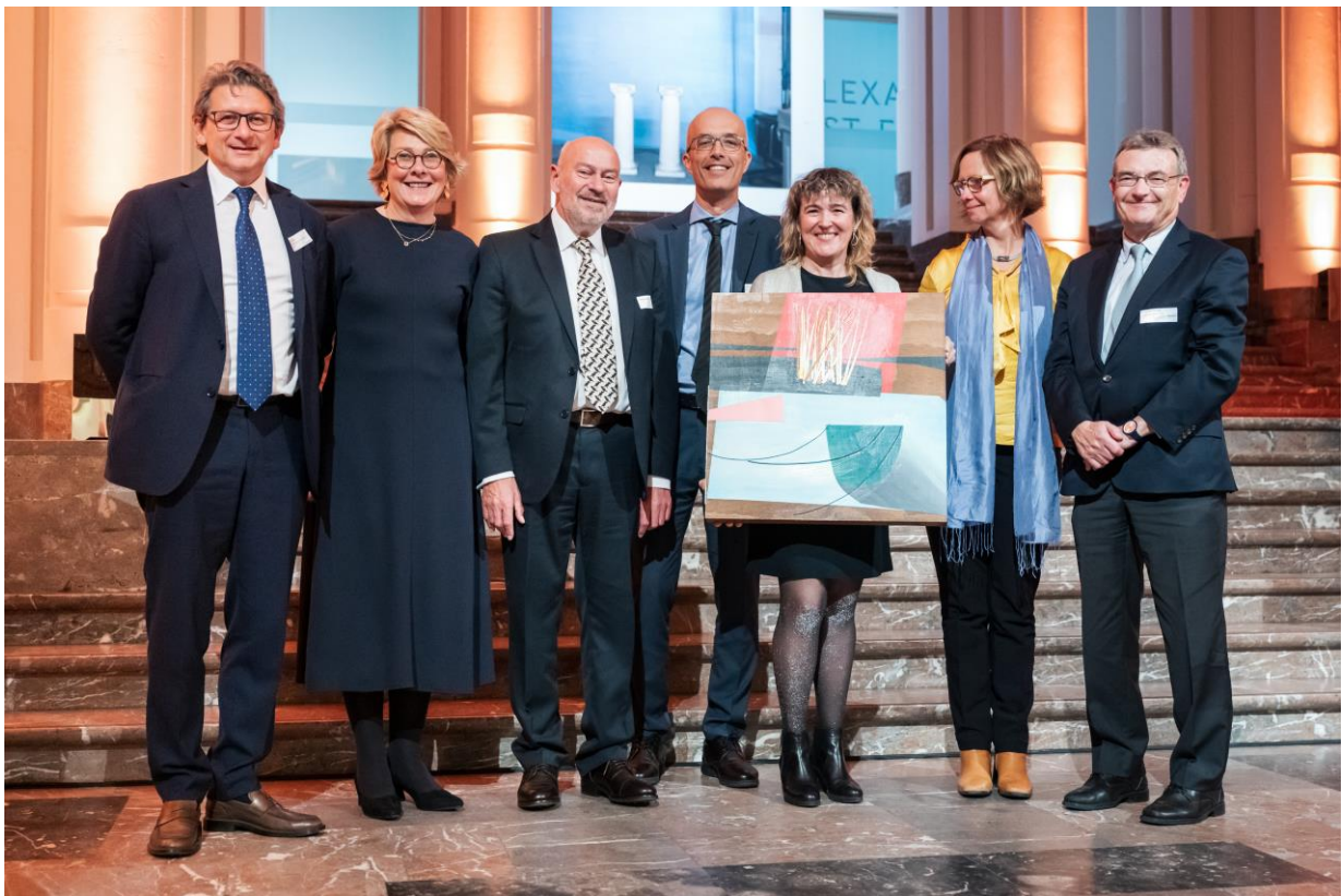
ESPO Award 2022: Port of Barcelona wins the ESPO Award

The fourteenth ESPO Award will be officially handed out during a ceremony which will be held in November 2023 in Brussels.