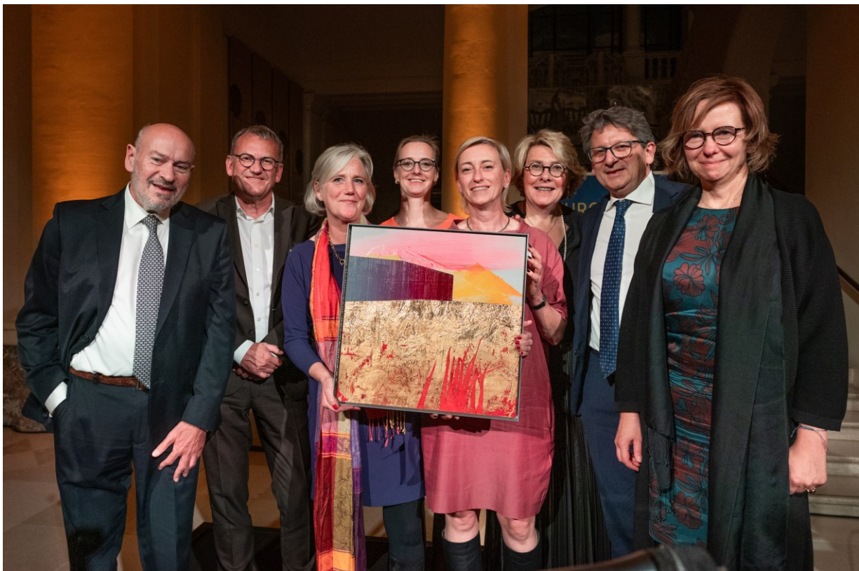
ESPO Award 2023: North Sea Port wins the ESPO Award

The 16 th ESPO Award will be officially handed out during a ceremony which will be held in November 2024 in Brussels.